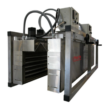
G3 Expandable tunnel