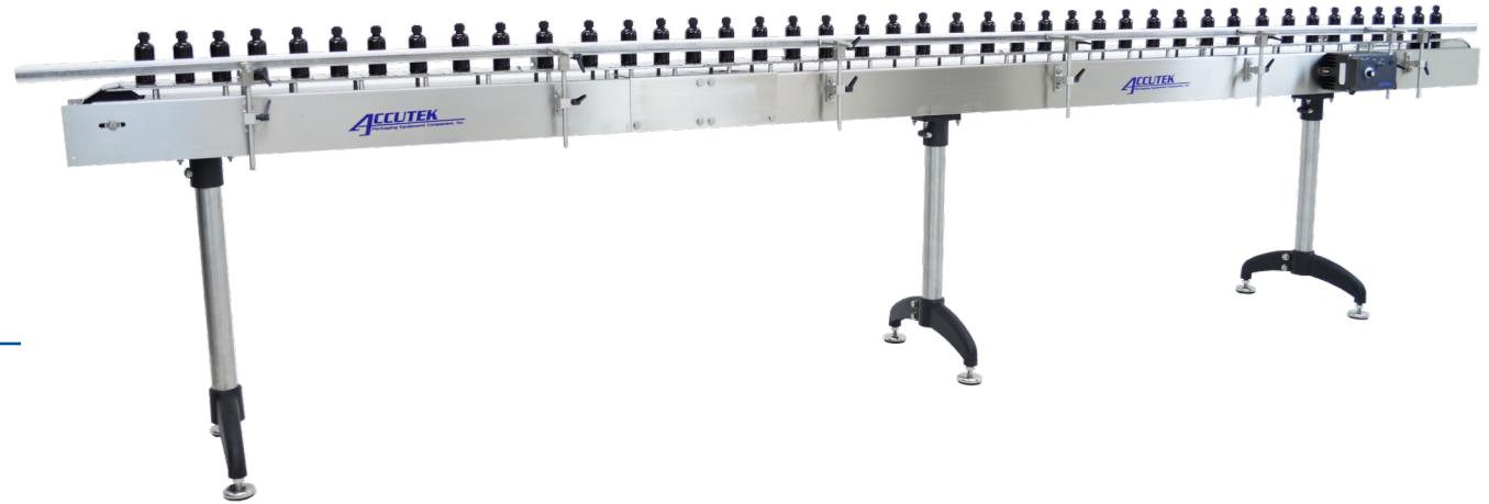
AccuVeyor 6 (15' Sanitary Pictured)