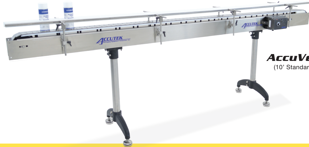
AccuVeyor 4 (10' Standard Pictured)

2980 Scott St, Vista CA 92081 • 760.734.4177 • Fax 760.734.4188 Email: sales@accutekpackaging.com • accutekpackaging.com